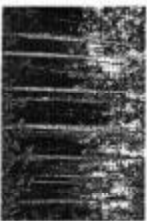
The route will take you into a poplar stand.

over 50 kilometres of groomed classic and skate skiing trails suitable for all ages and skill levels. There are several loops to choose from which provide a variety of trail lengths - short distance, perfect for before or after work, or long distance for those half or day-long adventures.