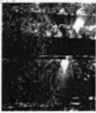
Trails are available for summer use as well as winter skiing

The Longlac Cross-Country Ski Club trail system is located on the north side of Hwy 11. There are